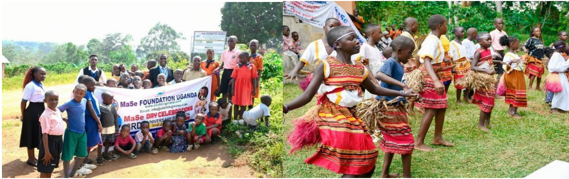
Yearly MaSe-day celebration